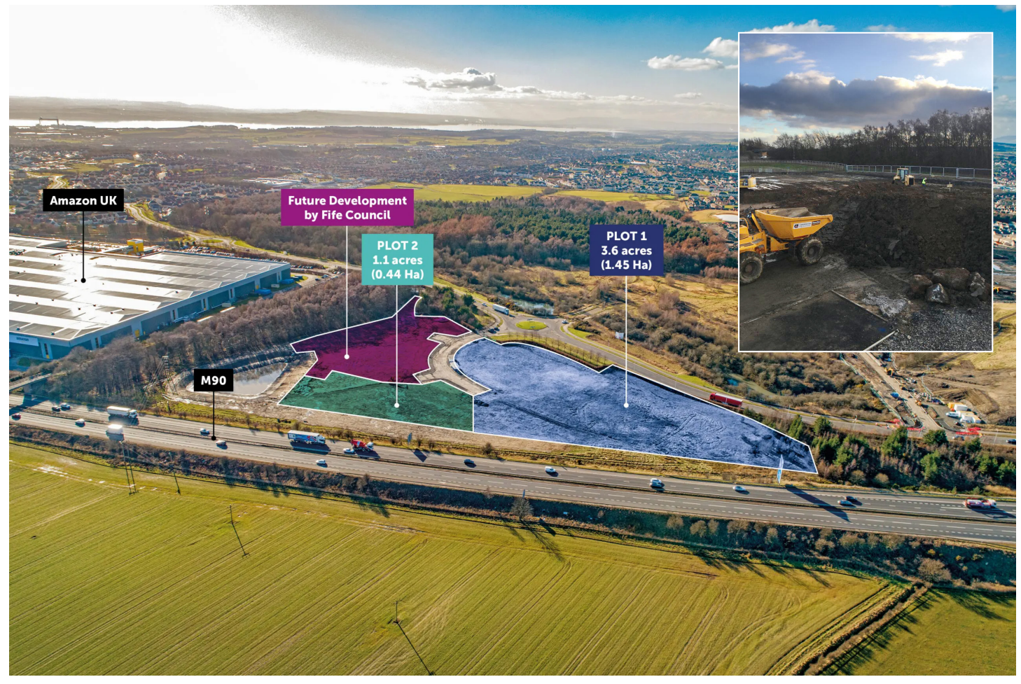
Ring fenced: Work gets underway at Fife Interchange North