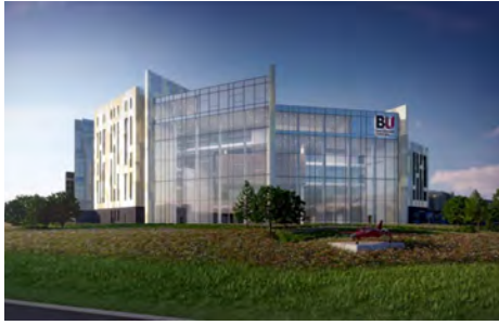
Bournemouth Gateway Building, Lansdowne Campus

Profile is delighted to welcome Bournemouth University as a new client within our South West Division.