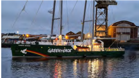
Cop this action: Greenpeace's Rainbow Warrior sails in.