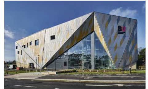
Poole Gateway Building, Talbot Campus

This vision which they dub "Fusion" brings together the contribution of staff, students and graduates. Profile hopes that its team of dedicated Officers and Managers will soon be making its contribution as we provide a series of bespoke services. These include front of house reception, library support, an out-of-hours emergency point of contact and a mobile