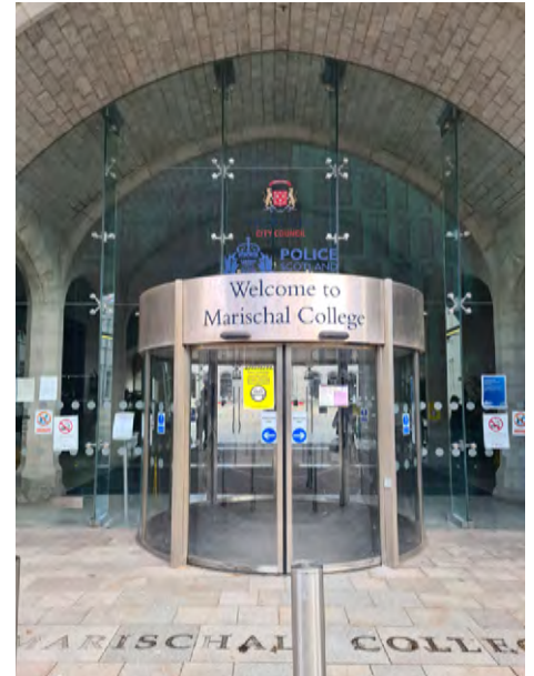
Mixing old and new: the iconic Marischal College building is home to Aberdeen City Council

Following a pitch in 2021, Profile Security has added to its existing portfolio with Aberdeen City Council.