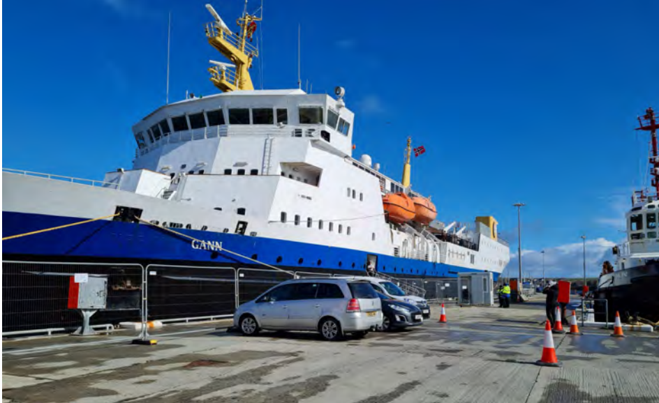
All aboard: Profile teams will be on hand to ensure smooth sailing in and out of the Orkneys.

Profile's maritime business goes from strength to strength with the news of a successful tender for the Orkney Islands Council cruise season contract.