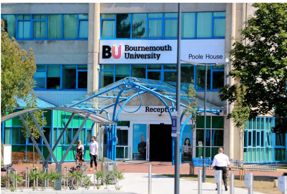
Poole House, Talbot Campus