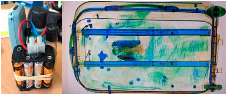
Testing times: a dummy IED (left) was placed inside a case (above) to make sure it was spotted by X-ray machine security staff. The operator must decide whether the phone is an integral part of a device by observing what's around it and by looking at wires and batteries close to it.

A dummy IED device designed to replicate a simple home-made bomb featured typical liquid mixing paraphernalia, along with some simple wiring, a battery pack and a mobile phone. This design was used because while it is easy to look like an IED, it shows up reasonably well to the X-ray operator without being too obvious.