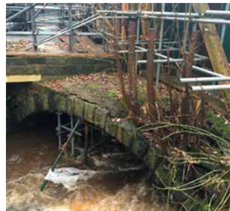
An eye on the flood: Profile's Specialist Services team has been fine tuning its ultra-quiet, long-lasting CCTV towers. The programme is set to roll out next year.

As part of the project, Profile Security provides a number of CCTV solutions to protect the construction sites and offices against theft and vandalism. One particularly challenging request was to provide 24/7 surveillance on a mill building that straddles the water. The issue here was not so much about vandalism as the potential build-up of debris: with the rushing water sweeping through the supporting scaffolding, the fear was that the entire building might collapse.