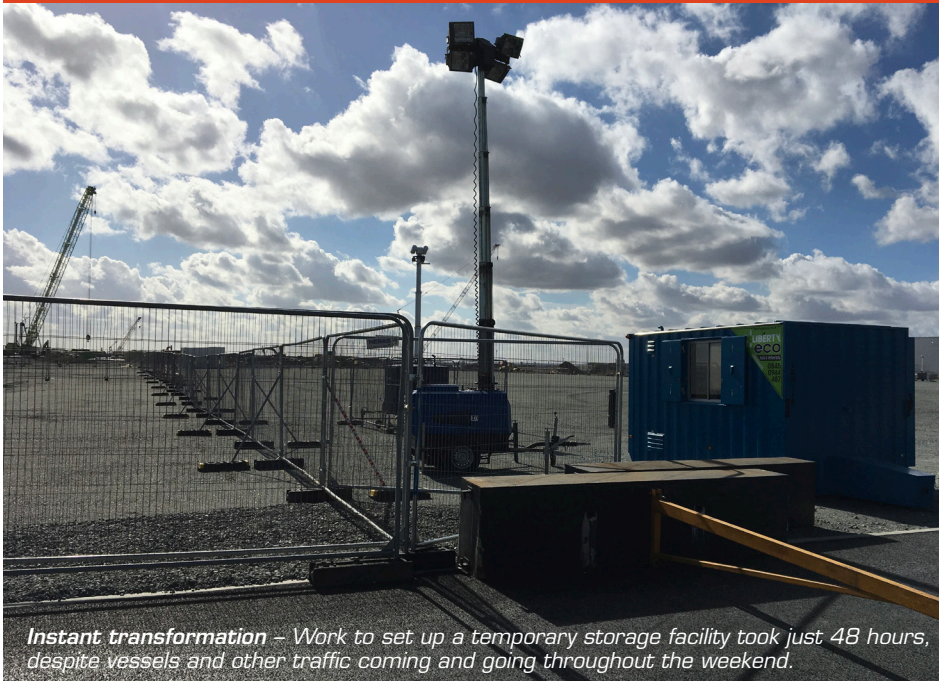
Instant transformation – Work to set up a temporary storage facility took just 48 hours, despite vessels and other traffic coming and going throughout the weekend.

Clients come to us with different needs and different challenges. Some of these can seem daunting, but as this case shows, there's nothing Profile people like better than a tall order!