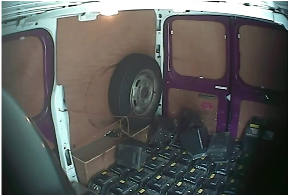
Inside job: Farleigh's tiny pinhole cameras went unnoticed by the gang as they went about defrauding the Local Authority.

After just three days, the signs were encouraging, prompting the team to double their surveillance efforts. They could see that the cash was being taken from the boxes using illegal keys, all this while the vehicles were in transit. The operation was soon extended in an effort to trace where the cash was being taken. As time went on, more and more staff were incriminated.