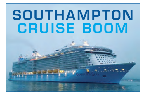
Royal Caribbean's Quantum of the Seas: hitech features include a skydiving simulator, robot bartenders and an observation pod that swings out 300ft above the sea.

Profile client ABP (Associated British Ports) is set to see the number of cruise liners calling at its UK ports rise still further.