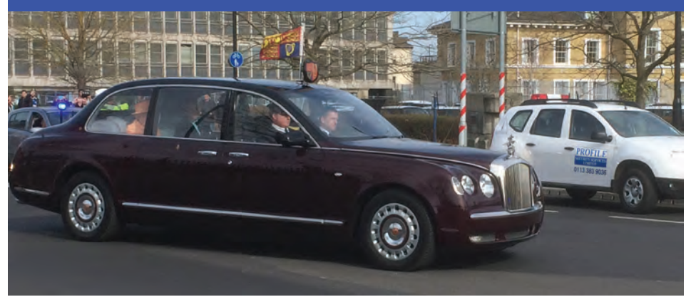
The Queen arrives in Southampton under the watchful eye of Profile's mobile patrols.

Amid the bunting and confetti of red, white and blue, Profile Security staff were privileged to enjoy an appointment with Royalty.