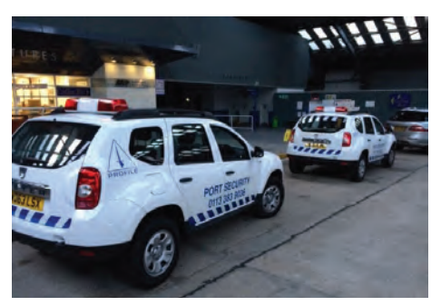
On call: Profile-liveried vehicles keep a watching brief over ABP's cruise terminal facilities. Part of a nationwide contract protecting cruise and container traffic.

Our thanks go to all of Profile's port staff who ensure that the highest levels of security are maintained and that the exacting standards which these sites demand are consistently met. Together, we look forward to a bright – and busy – future.