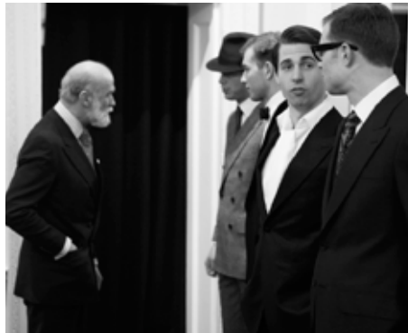
Prince Michael of Kent reviews a model line-up at the Hardy Amies event in London

As well as keeping an eye on the VIPs, the venue was stocked with some of the world's most expensive frocks and fabrics. Eagerly anticipated, this was