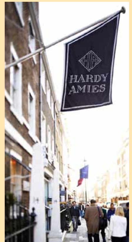
No. 14 Savile Row: making a comeback in 2010

Since his death in 2003, the team at No. 14 Savile Row have regrouped, drawing inspiration from the master and continuing to innovate as Hardy Amies would have done it. Impeccably.