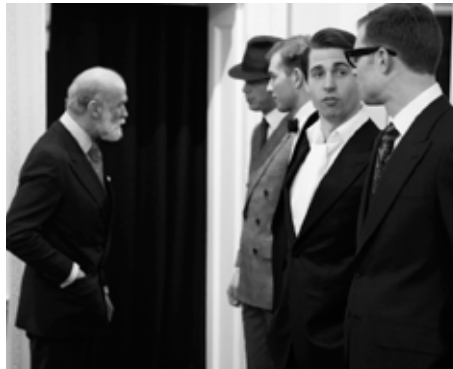
Prince Michael of Kent reviews a model line-up at the Hardy Amies event in London

As well as keeping an eye on the VIPs, the venue was stocked with some of the world's most expensive frocks and fabrics. Eagerly anticipated, this was