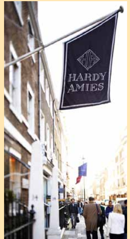
No. 14 Savile Row: making a comeback in 2010

Since his death in 2003, the team at No. 14 Savile Row have regrouped, drawing inspiration from the master and continuing to innovate as Hardy Amies would have done it. Impeccably.