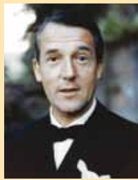
Stylish innovator Hardy Amies

Best known as one of Her Majesty The Queen's favourite designers, Hardy Amies was something of a pioneer.